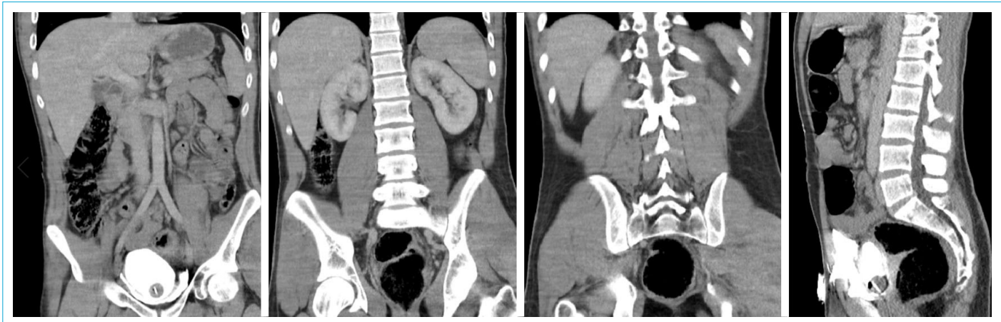
Figure 3. Coronal and sagittal images of the pelvis during CT cystogram demonstrates isolated bladder perforation.