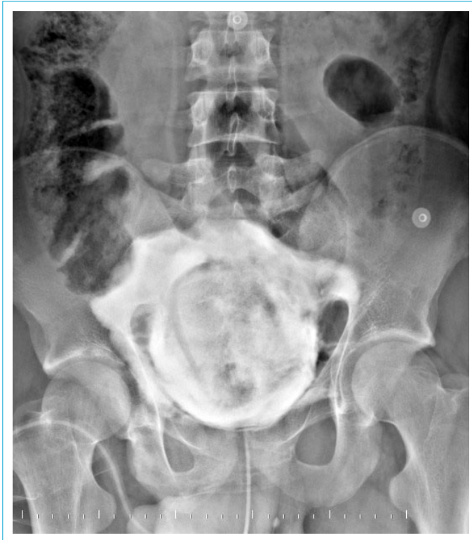
Figure 1. Image of the pelvis during retrograde cystography demonstrates contrast extravasating through wall of the bladder.

dominal organ other than bladder was confirmed. Two perforated areas were observed in bladder dome and trigone. Necrotized tissues were resected and bladder was repaired with watertight technique as two layers covering detrusor and mucosa using absorbable sutures. For bladder mucosa 4/0 vicryl suture was used, while 2/0 vicryl was used for muscles and adventitia. A drain was placed in abdominal cavity. Urinary diversion was provided 20 Fr three-way catheter. No cystectomy was required. Cystography taken on the 14th day after the operation showed the perfect repair of bladder (Fig. 4). Urethral catheter was removed. No